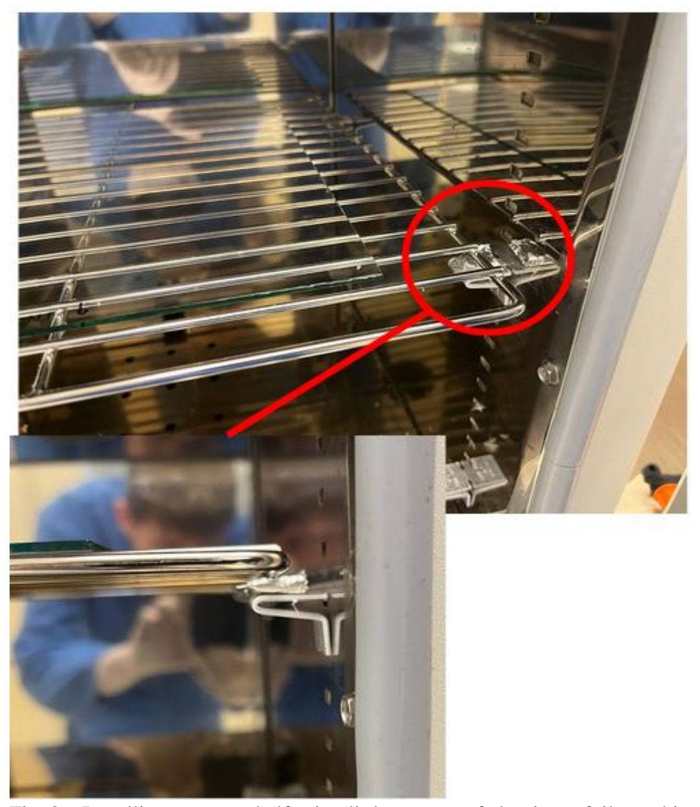
Fig. 2 – Levelling an oven shelf using little squares of aluminum foil to achieve a perfectly flat surface for curing the molded PDMS.