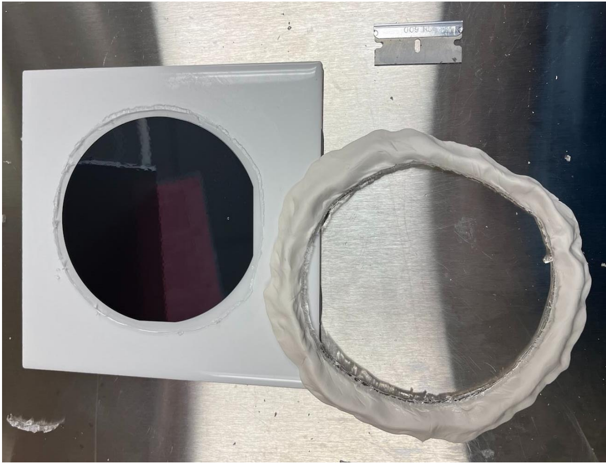
Fig. 3 – Using the blade, cut around the perimeter of the PDMS, then gently pull the clay up and away from the ceramic tile.